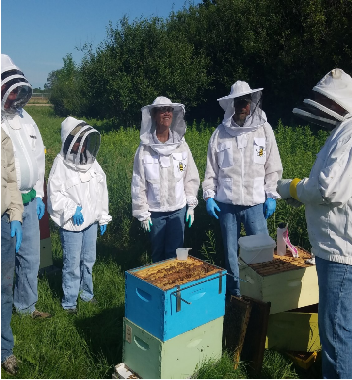
Heroes to Hives Program