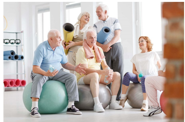
Matter of Balance, one of the programs that is available as part of MSU Extension's Fall Prevention programming.