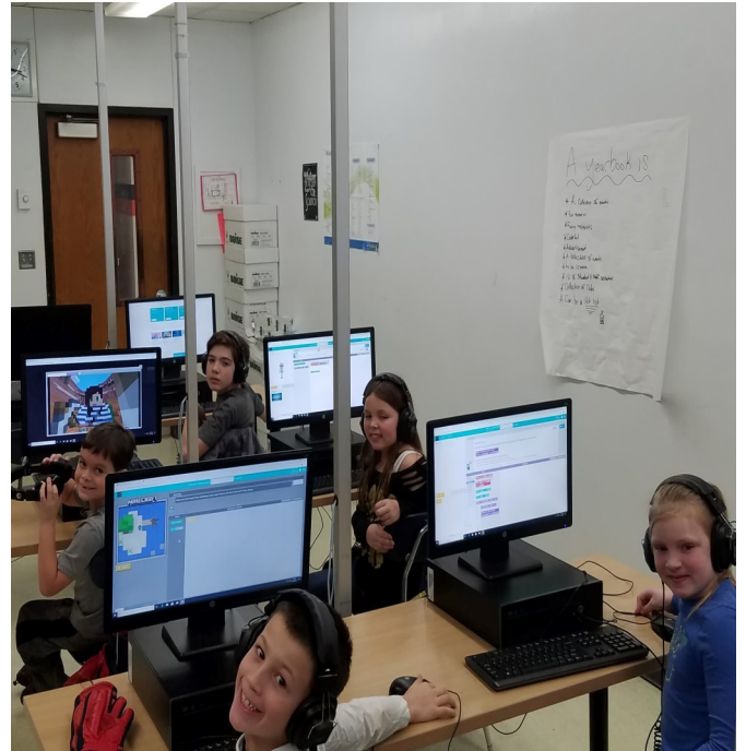
Luce County 4-H SPIN Club—Coding