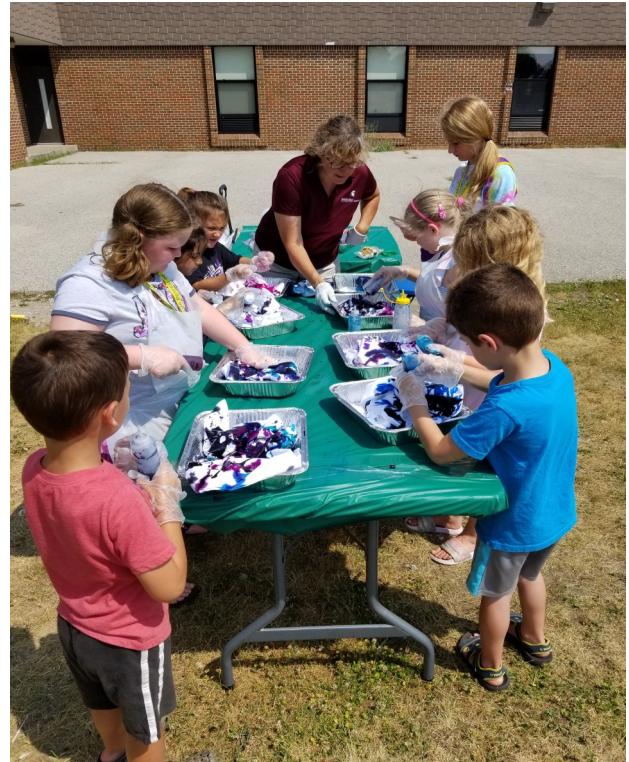
Various activities held during Luce County 4-H Day Camp 2019

The camp was funded by a $500 donations from Children's Trust Fund , which went directly to food costs associated with providing healthy lunches and snacks for the week-long program. The Luce County 4-H Council also contributed $500 which covered supplies costs. The cost of the camp was $10 per child, though scholarships were available for those needing help.