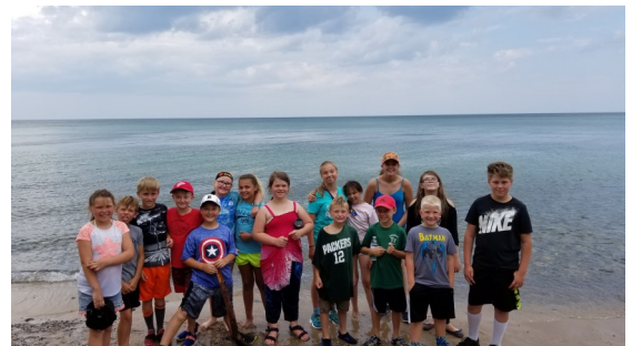
Luce County Youth gather for 4-H Day Camp 2019